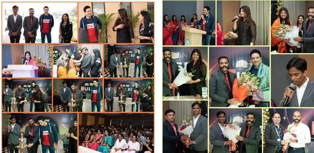
Welcome of guests & Inauguration of Event

On a vibrant day at the Bombay Institute of Pharmacy & Research, the Annual Prize Distribution Ceremony "Pulse-2024"* unfolded with great enthusiasm. This prestigious event celebrated the achievements of students in both sports and cultural activities.