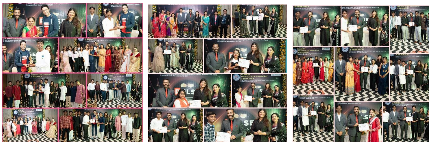
Prize distribution Events organized on 09 th March, 2024